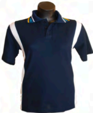
Sports Polo Shirt

Stylish dress trouser with cen-tre front button & zip opening, belt loops, side pock- ets, two back patch pockets