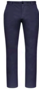
Mens Nova Trousers

Stylish dress short with centre front button & zip opening, belt loops, side pockets, two back patch pockets.