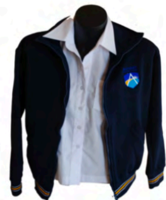
College Zip Jacket

Crew neck pull over, warm and practical poly cotton fleece with ribbed waistband, cuffs and neckline 65% Polyester, 35% Cotton