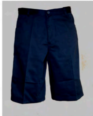
Mens Nova Shorts

Easy care short sleeved shirt with turned back cuffs 65% Polyester, 35% Cotton