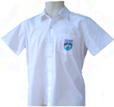
Mens White Shirt

Easy care short sleeved shirt with turned back cuffs 65% Polyester, 35% Cotton